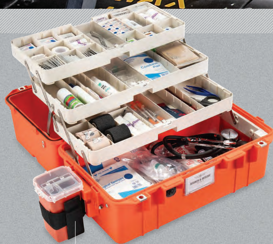
Storage bracket keeps used and sharp objects contained (sharps container and case contents not included).