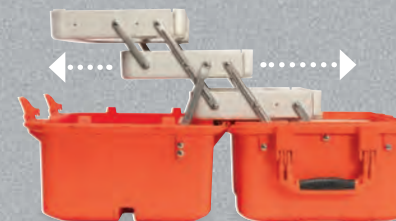
All trays slide forward (for full view) and back to original position